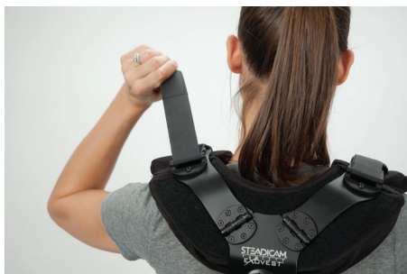
Adjusting under load

By virtue of the double and triple-purchase VELCRO® straps, you can tweak the force-placement characteristics of the vest without having to remove it. For convenience, retag the inner end of the waistband VELCRO® so the outer end closes close to the front of your body where you can grasp it easily.