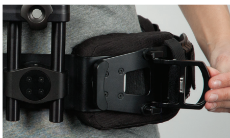
Over-center lever in relax position

In between takes, relax the entire vest by releasing the over-center lever at the waist.