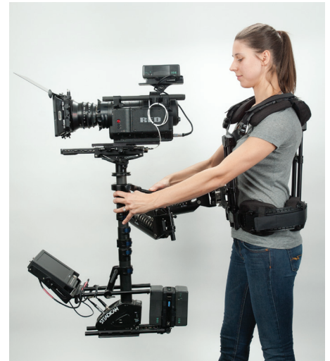
Keep the rods off your back

You should examine your posture in a mirror at this point. If the rods are touching your back because you are slouched forward, you may wish to correct this by standing up straight rather than by using a booster pad.