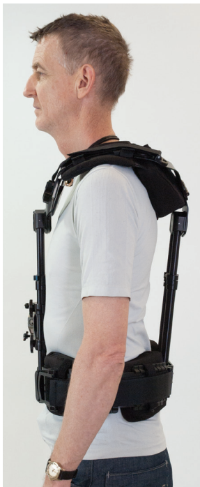
Room to breathe