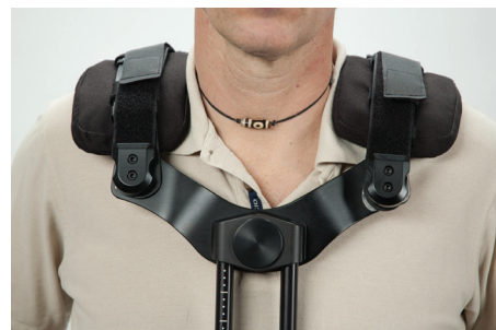
Shoulder strap placement

If the shoulder straps are too wide or too narrow, or the dovetail latch is difficult to fasten, you need to conform the shoulder straps to better match your anatomy. Remove the vest, and slightly loosen the four allen screws at front (shown below), then slacken the shoulder VELCRO® so you can slightly loosen the four allen screws to the rear.