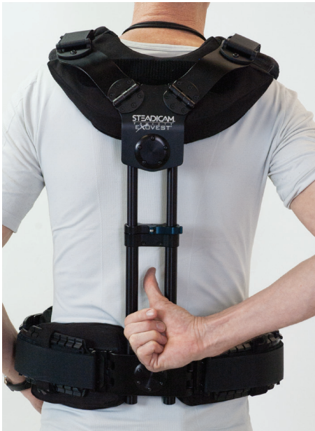
Centering the rods