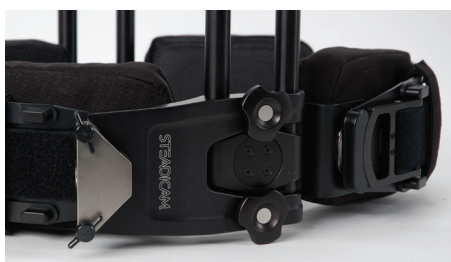
Bridge plate jumping lower pivot

If you require a low lens height, or simply prefer to have the socket block mounted lower than usual, you can set the bridge plate to jump over the lower pivot. Be advised that the further the Steadicam® arm attachment point is from your own shoulder, the more likely you are to limit your boom range. (Goofy operators, see Section 6.)