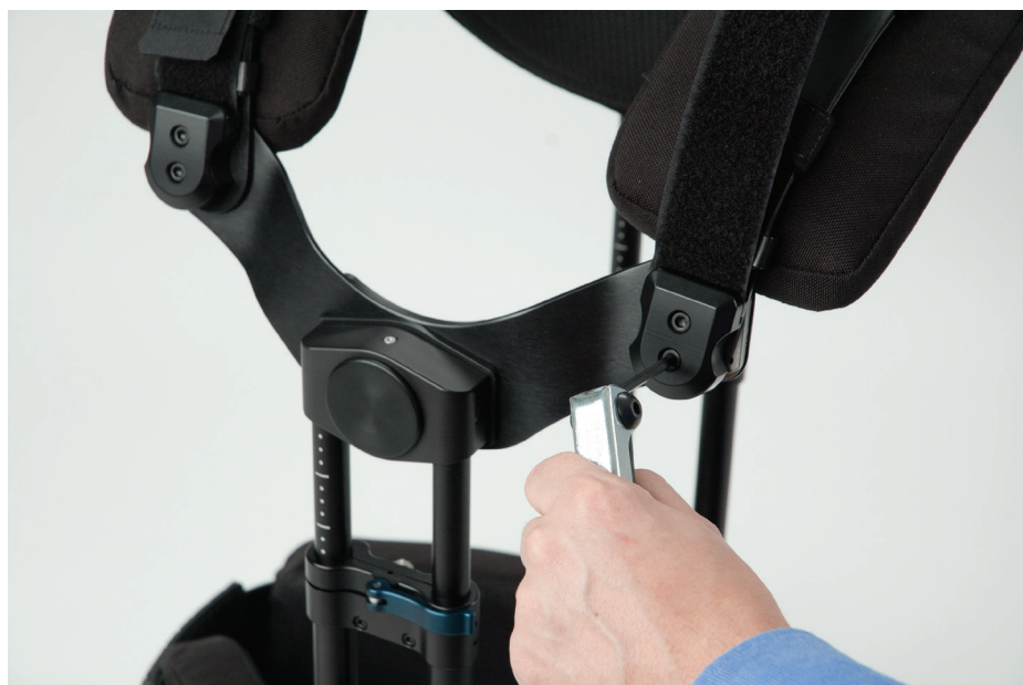
Adjusting shoulder strap clearance

Fasten the shoulder latch securely, then release the front rod clamp to allow the front rods to find their own level. Now adjust the shoulder width by sliding the straps to left or right. Holding both sets of rods horizontal in their pivots, tighten the screws while maintaining a symmetrical distance between each shoulder strap and the centerline of the vest. If you can get someone else to do this for you, while you are wearing the vest, all the better.